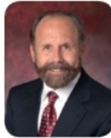
SENATOR JERRY HILL