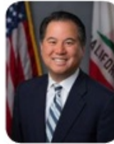
ASSEMBLYMEMBER PHIL TING

"This trip is well worth your time! Plus, it offers behind the scenes access to our State Capitol, and an intimate meeting with our San Mateo County legislators."